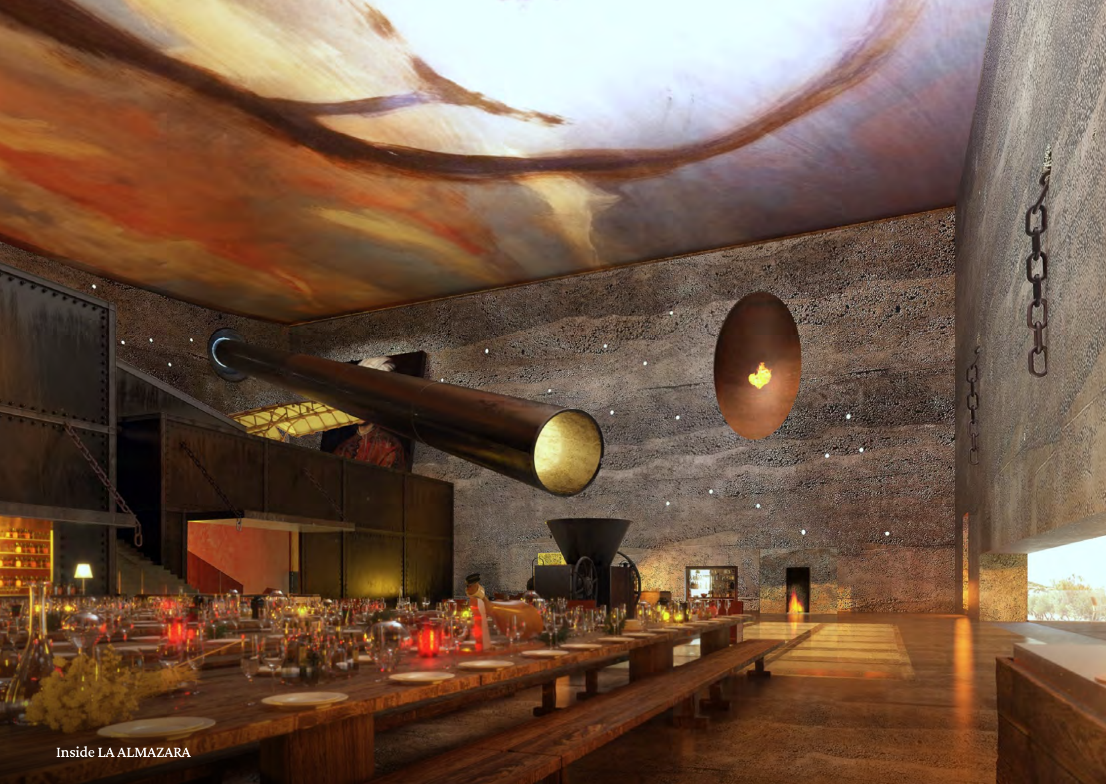
Inside LA ALMAZARA